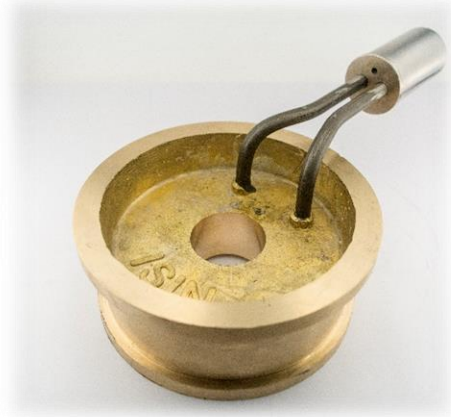
Brass Cast-in Heaters for Filter Industry