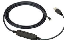
Omron® USB data cable (E58-CIFQ2)